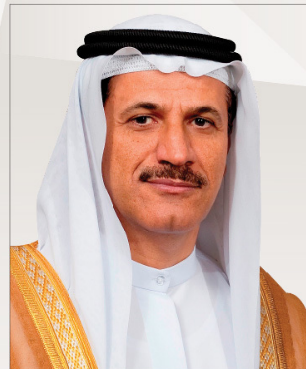
H.E. Eng. Sultan Bin Saeed Al Mansoori Minister of Economy, United Arab Emirates

In celebration of innovation, which is deeply embedded in our heritage, the UAE formally extends a warm welcome to the innovators and pioneers of the world who aspire to create solutions to the challenges we face globally.